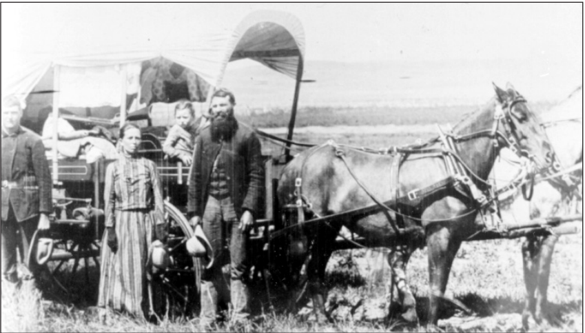
Family in Covered Wagon