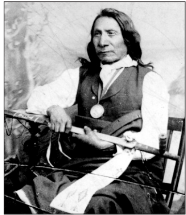
Chief Red Cloud, Oglala Sioux

When white explorers and fur traders began to penetrate the area in the 18th century, the Native Americans usually welcomed them and eagerly exchanged furs for guns, blankets, clothing, alcohol and other items. Such contacts also spread diseases such as