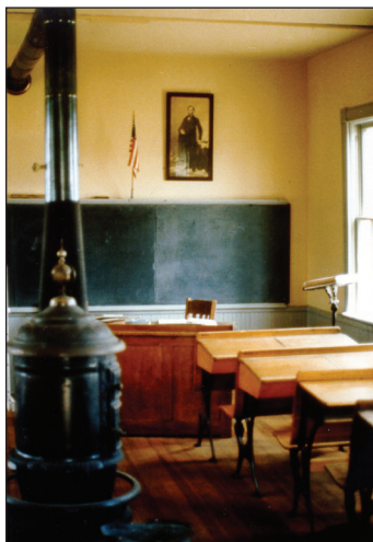
One-Room Schoolhouse Replica at the Stuhr Museum in Grand Island

Missionaries established the first Nebraska schools to assimilate Indians into white culture. The U.S. Army started the first schools for white people at Fort Atkinson (near present-day Fort Calhoun) in the 1820s. In 1855, the first Legislature of the Nebraska Territory adopted a free-school law, one year after the territory was established.