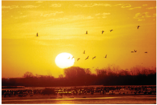
Platte River in Early Spring

The Platte River valley has been an important east-west human transportation corridor throughout history. The Oregon, Mormon and California trails, the Pony Express route, the Union Pacific transcontinental railroad, the first transcontinental paved highway (U.S. Highway 30) and Interstate 80 all have followed the Platte.