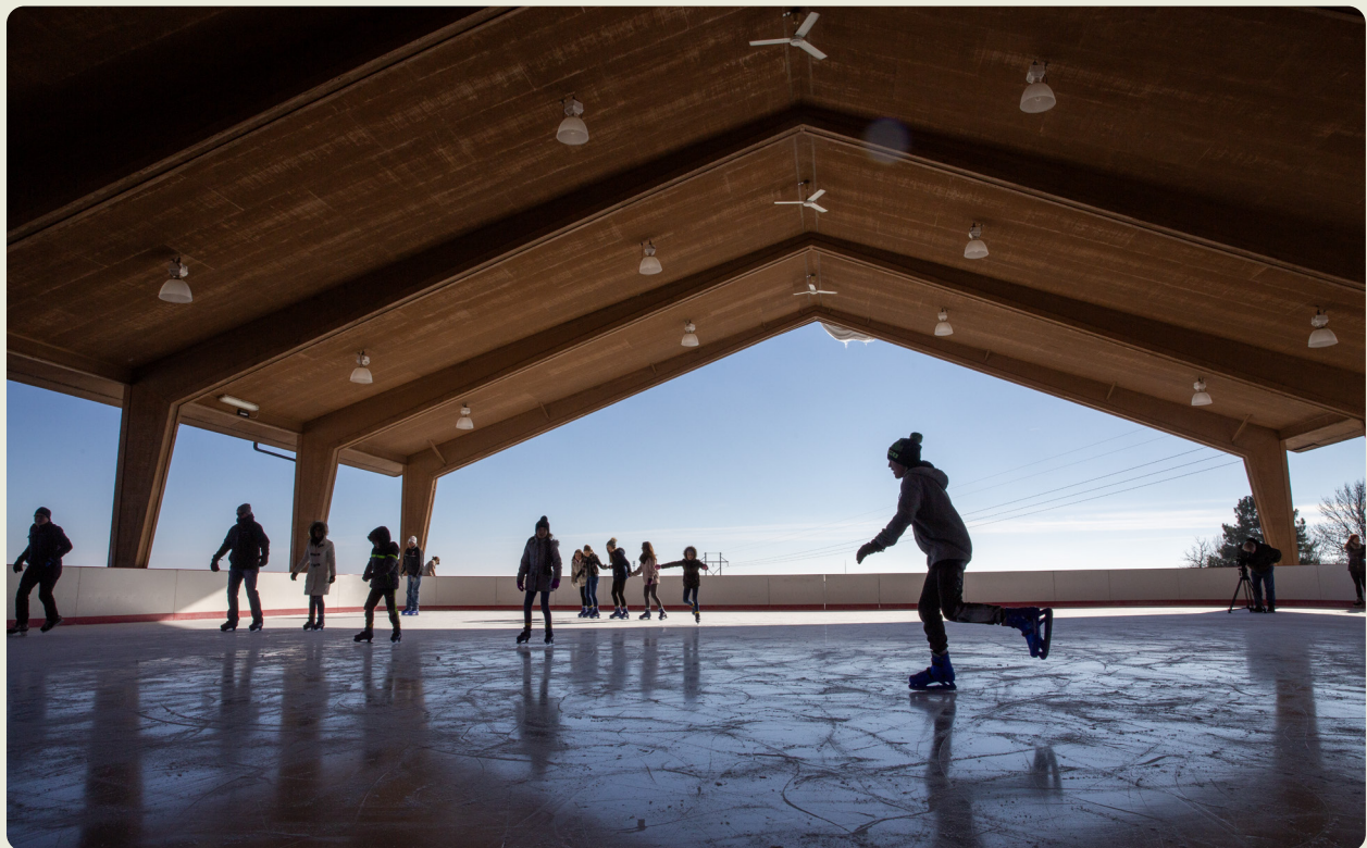
The flooring at Eugene T. Mahoney State Park ice rink is beyond repair and is scheduled to be replaced in fiscal year 2025-'26 with a new synthetic flooring intended to last longer and require less maintenance.

Rock Creek Station State Recreation Area lagoon repairs