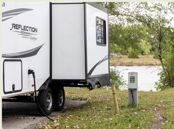
Fremont Lakes State Recreation Area saw its electrical grid updated at Pathfinder and Victory Lake campgrounds thanks to the Capital Maintenance Fund.

Ponca State Park Eric Wiebe Shooting Complex electrical service installation