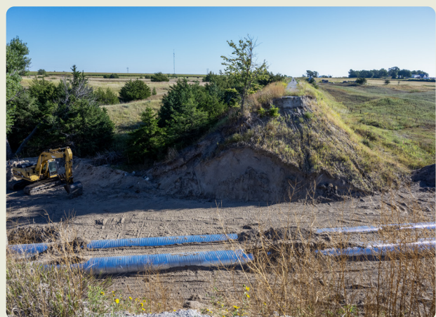
A new culvert was installed to carry water beneath the Cowboy Trail west of Long Pine. The trail washed out during historic flooding in March 2019.

JENNY NGUYEN-WHEATLEY, NEBRASKA GAME AND PARKS COMMISSION