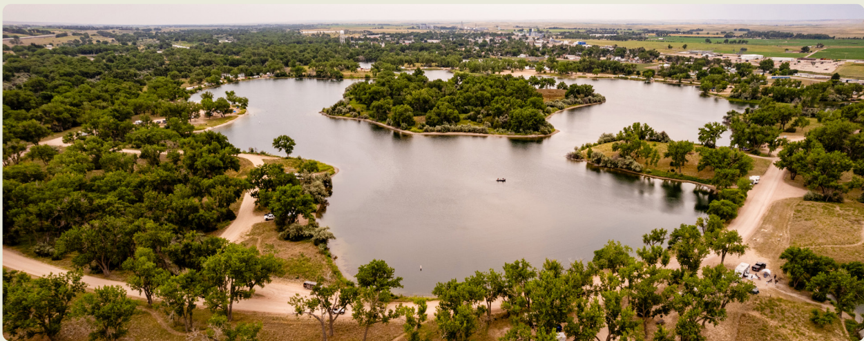
Channel widening of Center Lake, shown here, at Bridgeport State Recreation Area is be completed for the safety of boat traffic. The project utilizes Capital Maintenance Fund dollars.