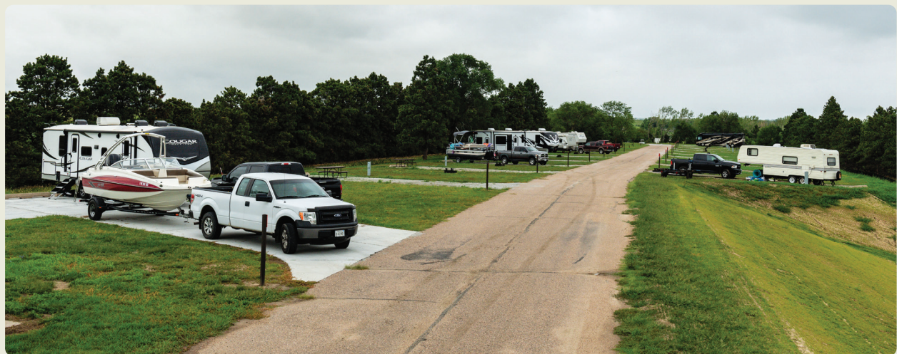
The campground at Sherman Reservoir State Recreation Area was expanded in fiscal year 2023-24 using Capital Maintenance Fund and park cash dollars.