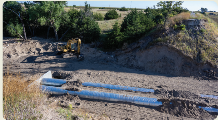
(Left) A new vault toilet was installed at Long Pine State Recreation Area. (Right) Culverts are installed where flood damage occurred along the Cowboy Trail, west of Long Pine.