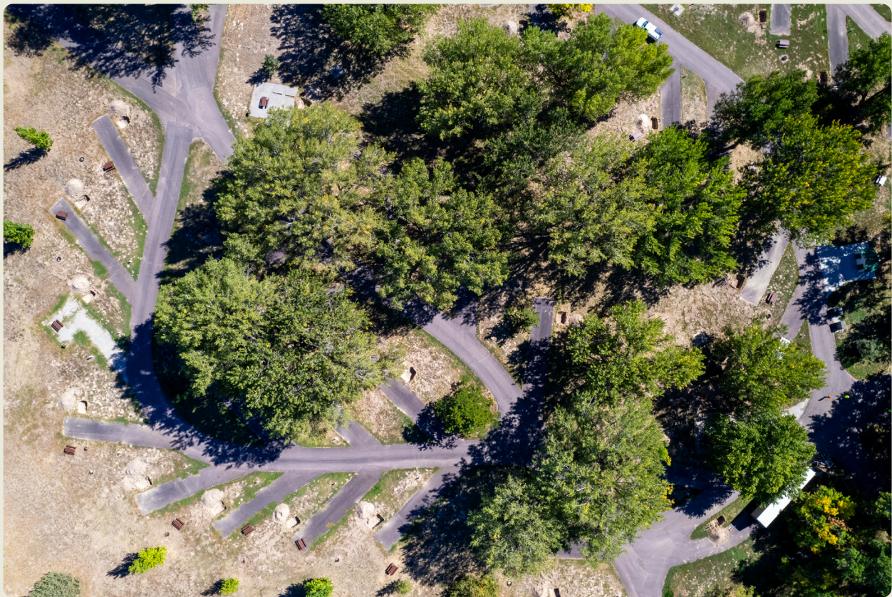
Soldier Creek Campground sites were upgraded to 50-amp service at Fort Robinson State Park in Dawes and Sioux counties. The electrical upgrade was completed in fiscal year 2022-23.