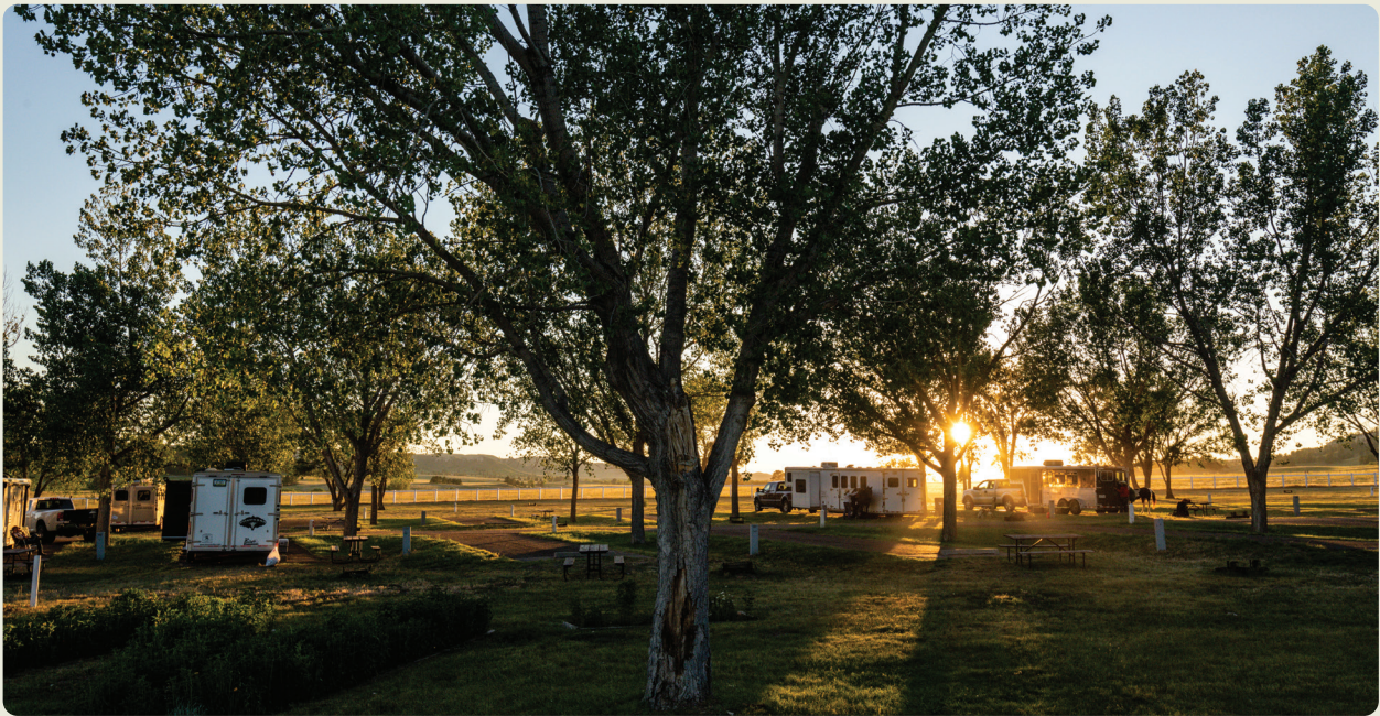
Fort Robinson State Park's Mare Barn Campground is being expanded to include 24 full-service sites, including American with Disabilities Act-compliant sites.