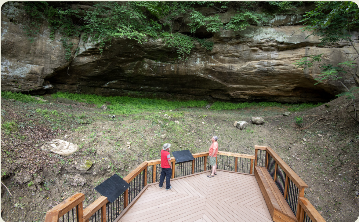
A new boardwalk and deck replaced a failing structure, giving visitors an up-close look at the iconic cave at Indian Cave State Park in Richardson County, while also protecting the historic petroglyph etchings. Visitors can reach the deck at the base of the cave via a stair tower or a ramp that is compliant with the Americans with Disabilities Act.