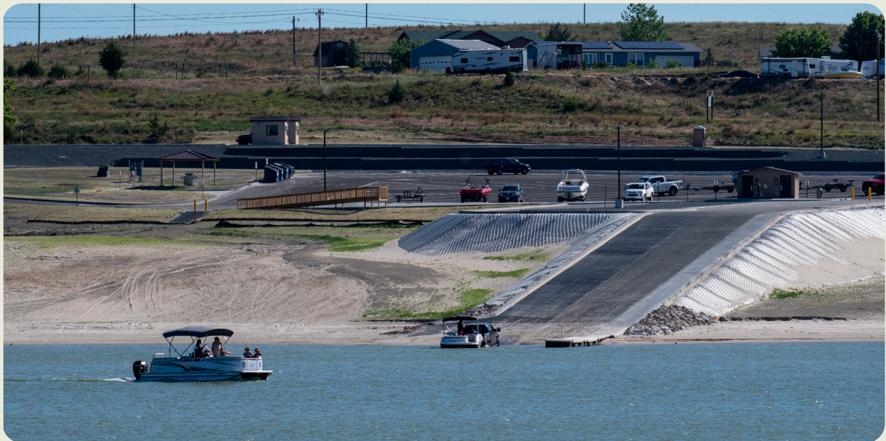
An improved boat ramp, parking lot and Americans with Disabilities Act-compliant ramp in Martin Bay are part of a Motorized Water Trails project at Lake McConaughy State Recreation Area in Keith County. This phase of the project, completed in May 2022, was funded partially by the Capital Maintenance Fund.