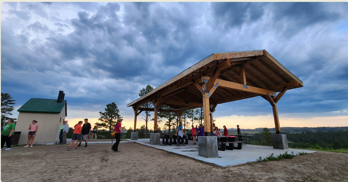
Participants gather at the new Pinecone Shelter for a Wildflower Week event at Chadron State Park. The shelter was made Americans with Disabilities Act-compliant in fiscal year 2022-23 using Capital Maintenance Fund dollars and park cash that included a donation by the Nebraska Game and Parks Foundation.

Capital Maintenance Fund dollars are spent on improvements at agency facilities statewide, and accomplishments to date have produced numerous positive comments.