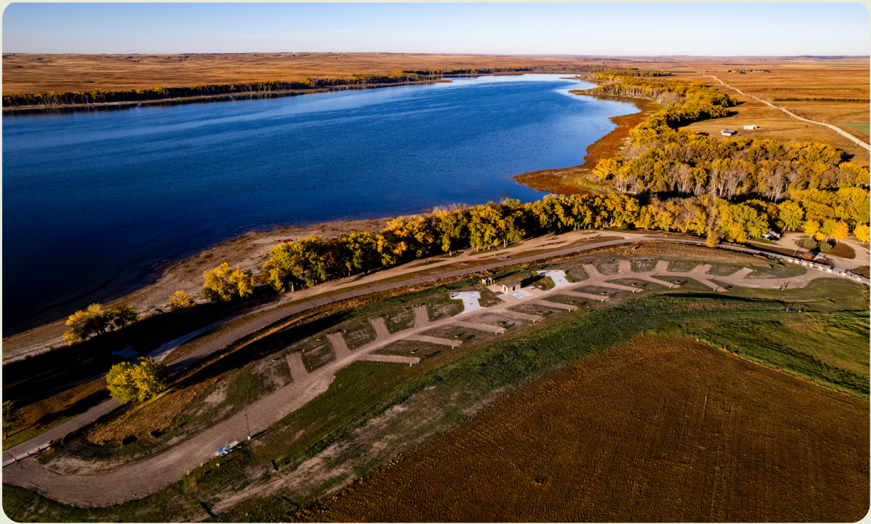
Box Butte State Recreation Area campground in Dawes County is getting access and traffic flow improvements at its most popular entrance. Campground improvements, including Americans with Disabilities Act-compliant sites, showerhouse and dump station, will better serve campers and anglers visiting western Nebraska's popular Box Butte State Recreation Area.