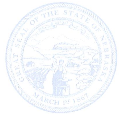
Pete Ricketts, Governor