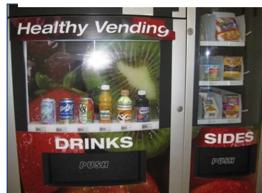
Healthy Vending machine at Adams County Courthouse