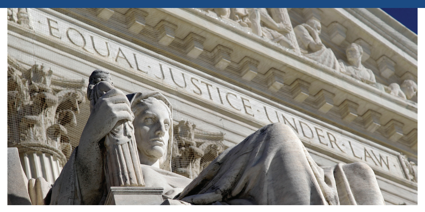
The 1964 Supreme Court case Reynolds v. Sims established the doctrine of "one person, one vote."

1961 Legislature adopts two proposed constitutional amendments relating to redistricting to be submitted to voters at the 1962 general election. One proposal establishes staggered four-year terms for legislators, and the other adds language loosening the county-line requirement.<sup>2</sup>