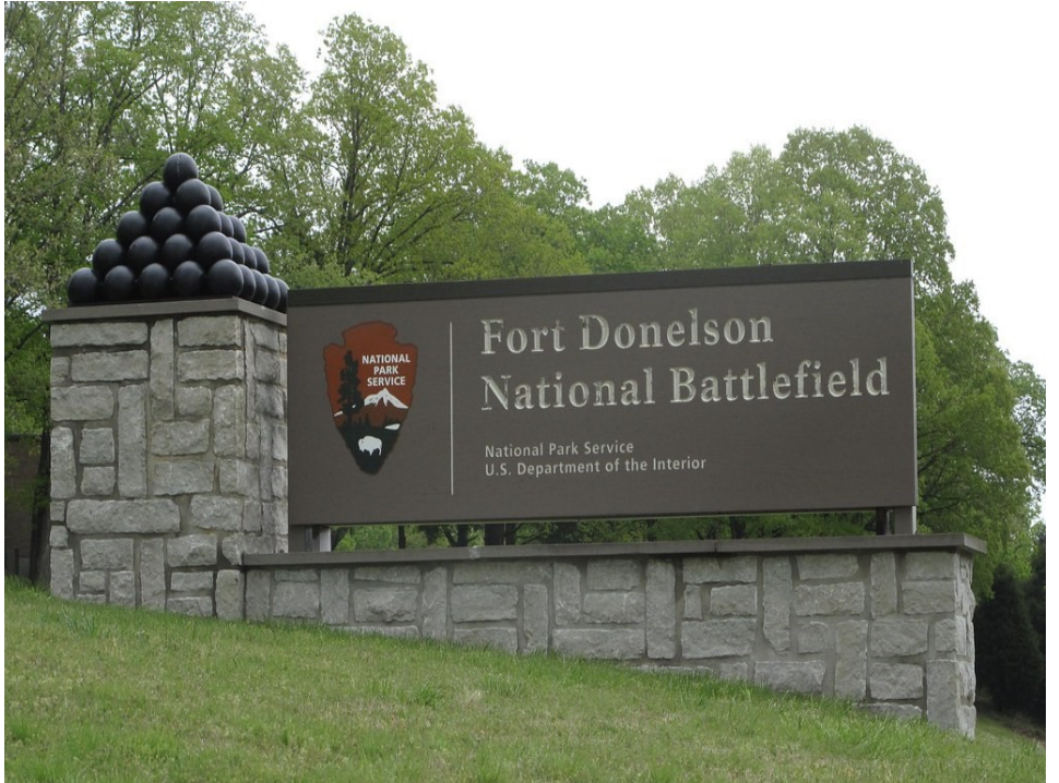
Fort Donelson National Battlefield is located in Dover, Tennessee.

The committee is created to oversee all activities pertaining to the creation and installation of a monument at the Fort Donelson National Battlefield in Tennessee, dedicated to the bravery of the Nebraska volunteer infantry who fought there in a pivotal Civil War battle. Committee members consist of an employee of the Nebraska State Historical Society; two members of the public who are members of a local Civil War round table organization; and a professor of history from the University of Nebraska, all of whom are appointed by the Nebraska Secretary of State. The final member is the chairperson of the Government, Military and Veterans Affairs Committee. The committee terminates upon completion of its purpose.